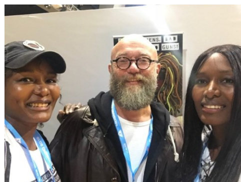
Dan Abnett hooking us up with a permanent moment in cyber history.