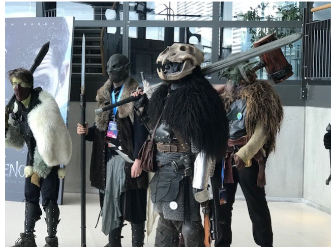
Orcs from Íslenskt LARP Kvikspuni) ready to battle Men, Dwarves and Elves.

We came across a well clad group of warrior Orcs, Dwarves, Elves and Knights, fighting over Middle Earth as we know it. So much enthusiasm and Icelandic pride radiated from each and everyone one of them. Íslenskt LARP (Kvikspuni) is a group of young men and women who make their own battle dress from steel, aluminum and leather as well as whatever they could find around the house to add to their dress. Intricate patterns on arm shields and cloaks. Extraordinary belts and head gear. We soon learned that many of the Icelandic locals were very skilled in old time arts such as leather crafting and armorers, with blacksmiths being dominant.